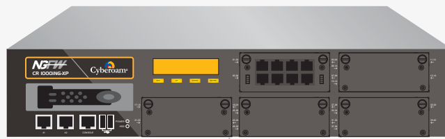
Flexi Ports Module